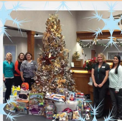
Russell Country FCU Staff

THANK YOU TO ALL of our Secret Santas who donated gifts and money to our giving tree.