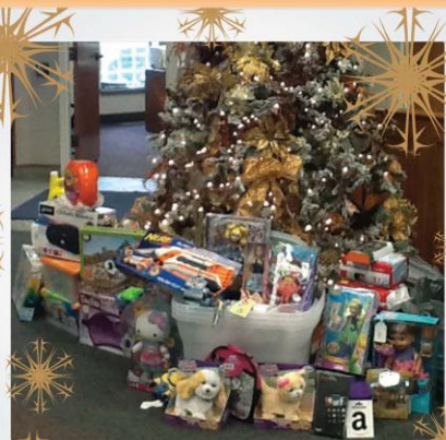
Children's Receiving Home Tree

Because of your generosity we were able to fill all the tags on the tree and provide a van load of gifts and other necessities to the children at the Children's Receiving Home.